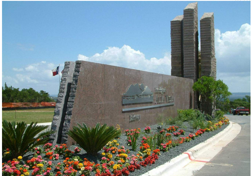
The monument sign consists of 41 foot long x 7 foot high freestanding polished granite slabs and 2 foot x 5 foot rough-cut granite pillars up to 25 feet high.